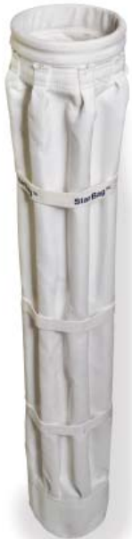
◀ Star Filter Bag 613-0163