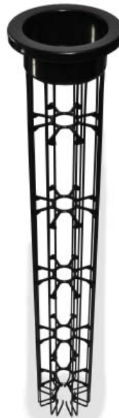
◀ Filter Cage (for use with Filter Bag 613-0163) 613-0164