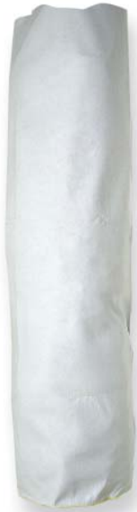
◀ Final Filter Bag 613-0058 HEPA Style Bag 613-0060