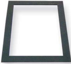
◀ Vacuum Compressor Clean-Out Box Door Gasket 690-0245