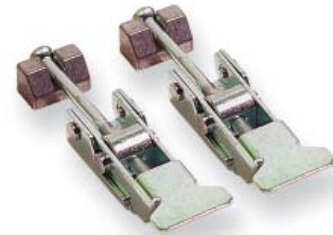
▶ Vacuum Compressor Clean-Out Box Door Latches (Pair with Mounting Hardware) 711-6342