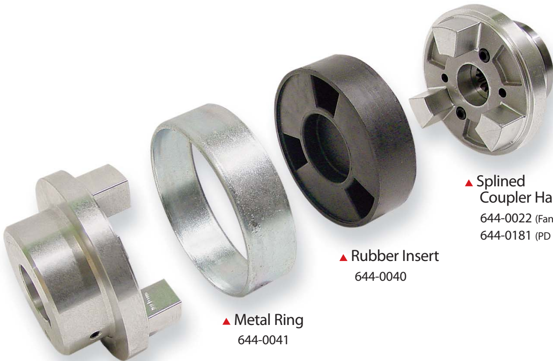
▲ Keyed Coupler Half 644-0020 (Fan) 644-0151 (PD Blower)