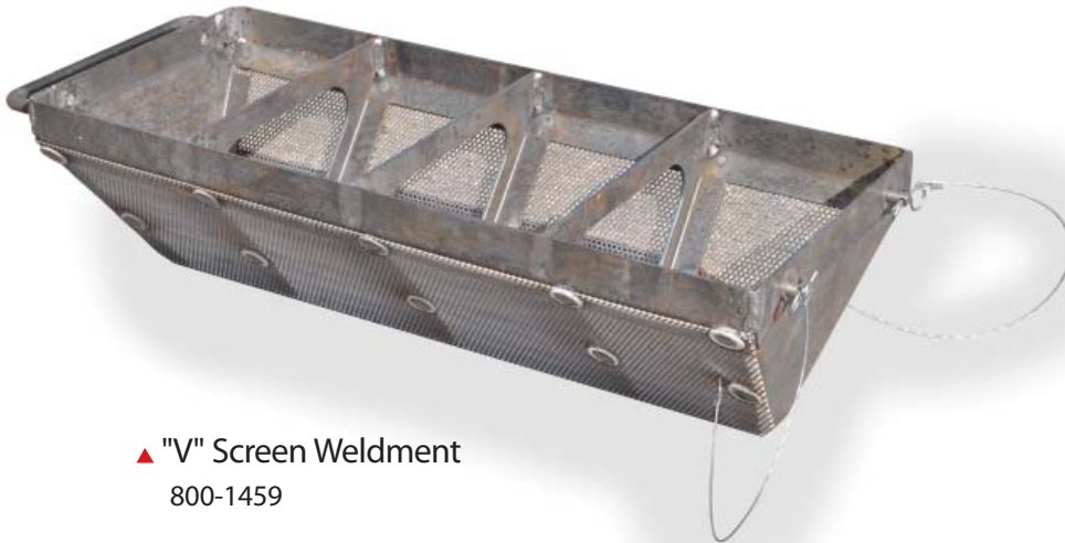
▲ "V" Screen Weldment 800-1459