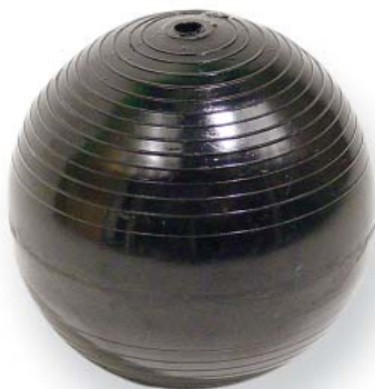
▲ Float Ball 6" diameter Plastic 690-0023