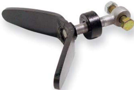
▲ Rear Door Safety Latch Assembly 711-0063