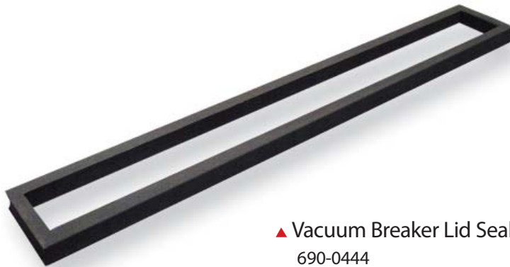
▲ Vacuum Breaker Lid Seal 690-0444