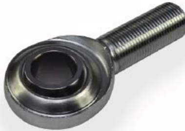
▲ Ball Joint Rod End 3/4-16 UNC Thread 605-0147