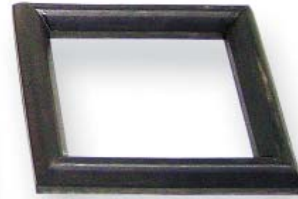
▲ Outlet Seal 690-0847