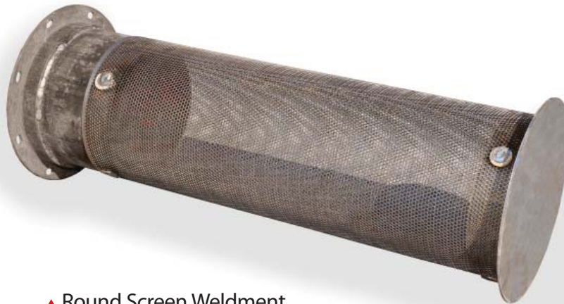
▲ Round Screen Weldment 800-9535