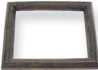
▲ Inlet Seal 690-0848