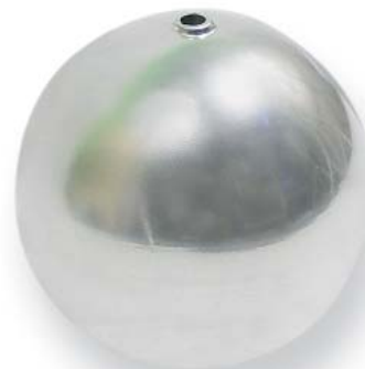
▲ Float Ball 6" diameter Stainless Steel 690-0745