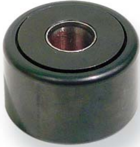
▲ Rear Door Cam Roller 690-1770