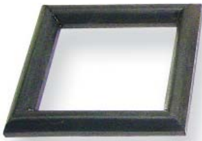
▲ Outlet Seal 690-0847