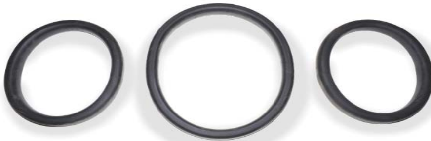
▲ Outlet Seal 690-1827