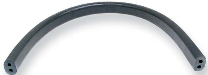
▲ Rear Door Seal (all models) 690-1179